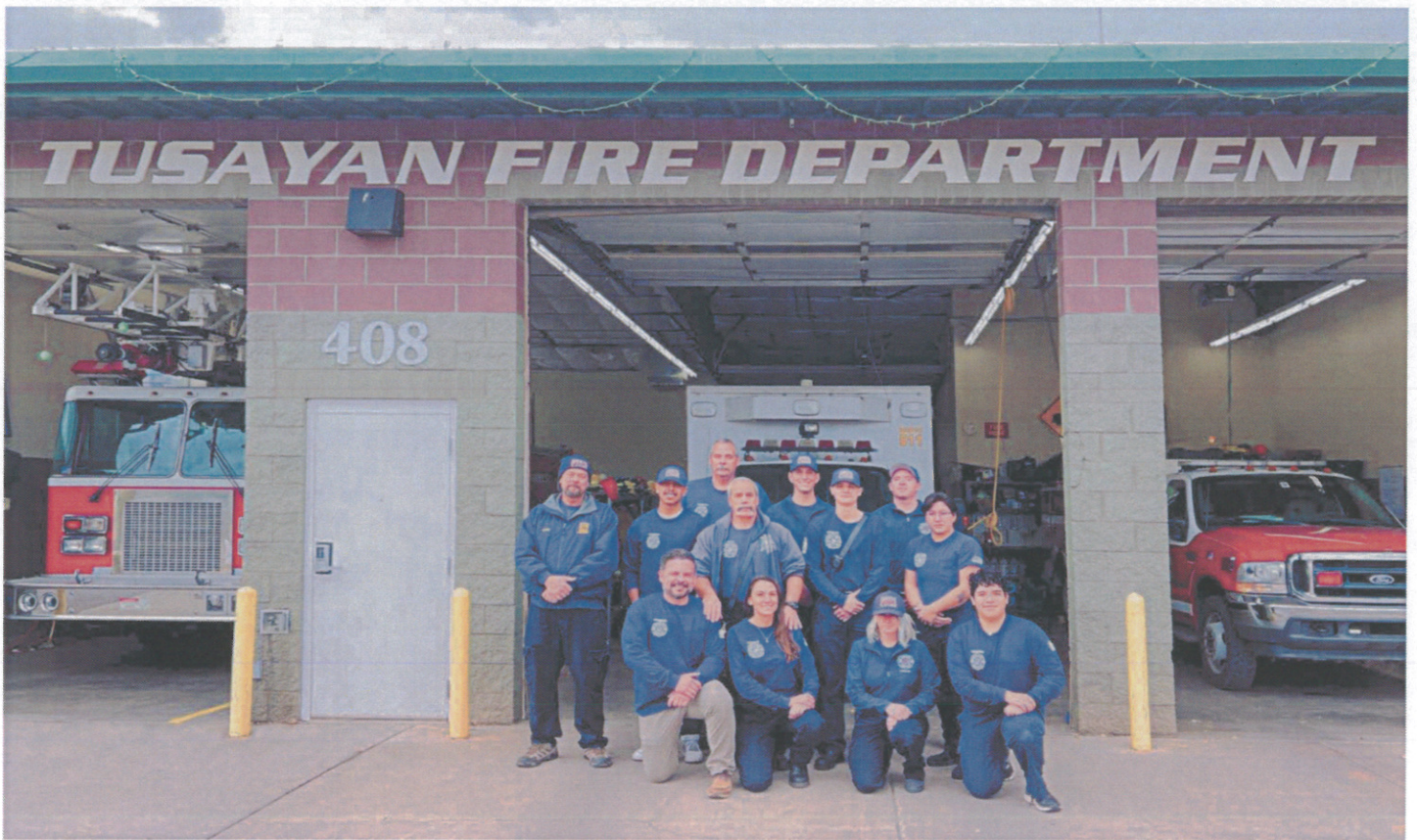
Greetings from Tusayan Fire!