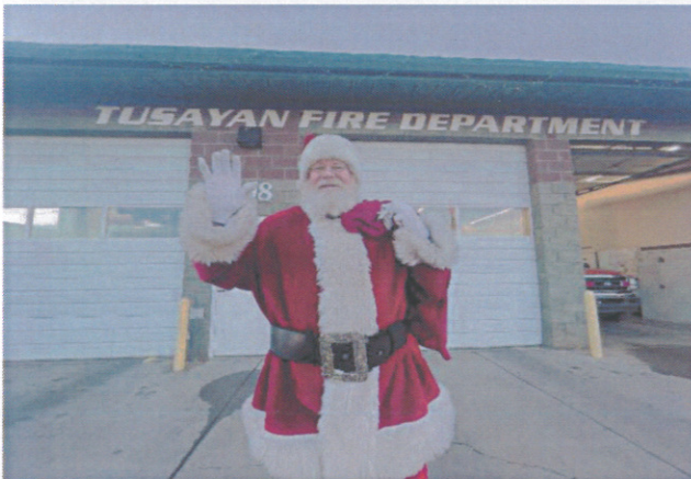
Santa Visiting TFD