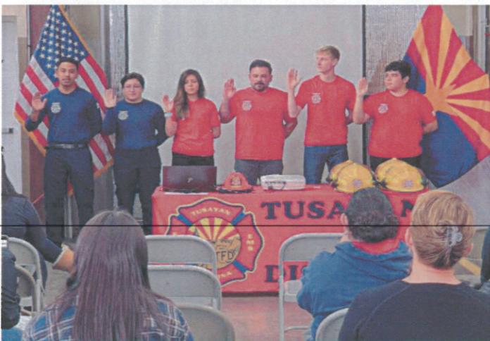
Volunteer Swearing in Ceremony 12/2/22