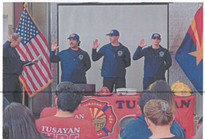
Career Swearing in Ceremony 12/2/22