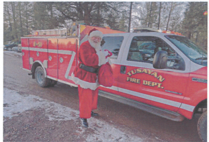
Santa being dropped off by TFD