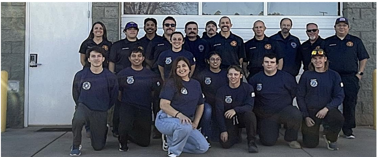
Career and Volunteer Firefighters