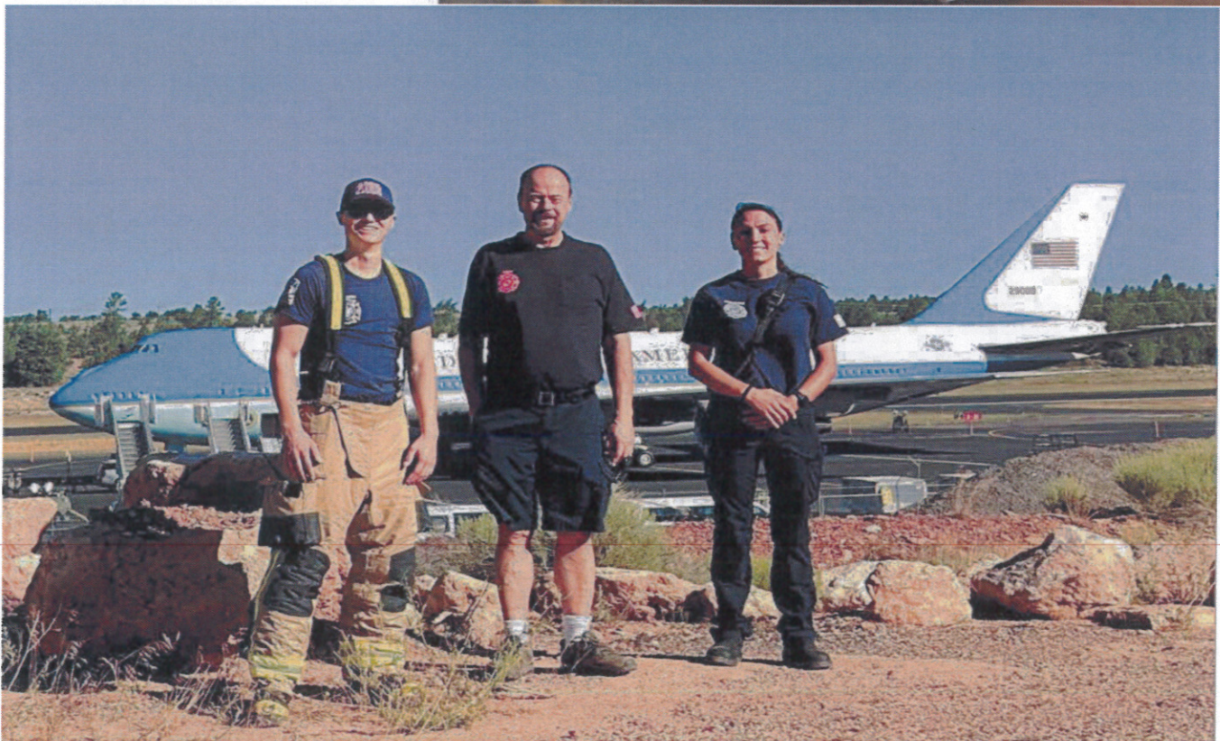
Tusayan Fire District assisted White House staff & Secret Service for President Biden's visit.