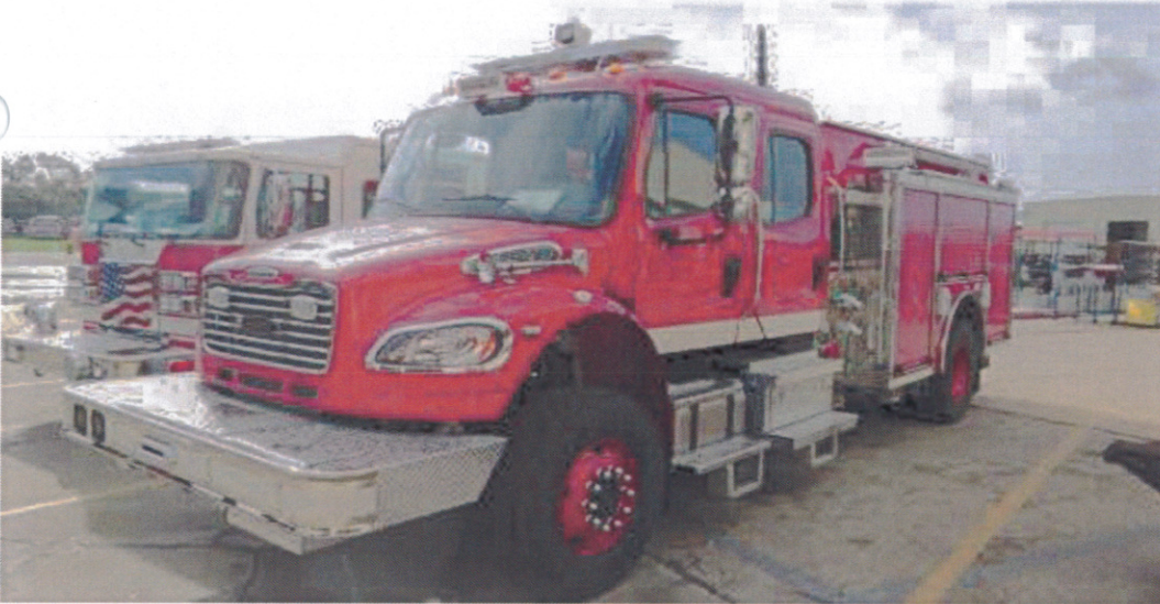
The Pierce Responder

The Pierce Responder Fire Engine is almost completed! Final inspections will be conducted in September.